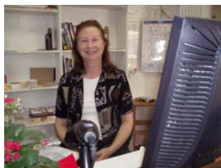
On June 30, 2006, LFPL

will be saying "Don't be a stranger" to a dear friend and colleague.